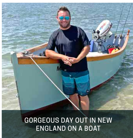
GORGEOUS DAY OUT IN NEW ENGLAND ON A BOAT