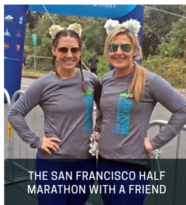
THE SAN FRANCISCO HALF MARATHON WITH A FRIEND