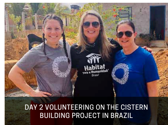
DAY 2 VOLUNTEERING ON THE CISTERN BUILDING PROJECT IN BRAZIL