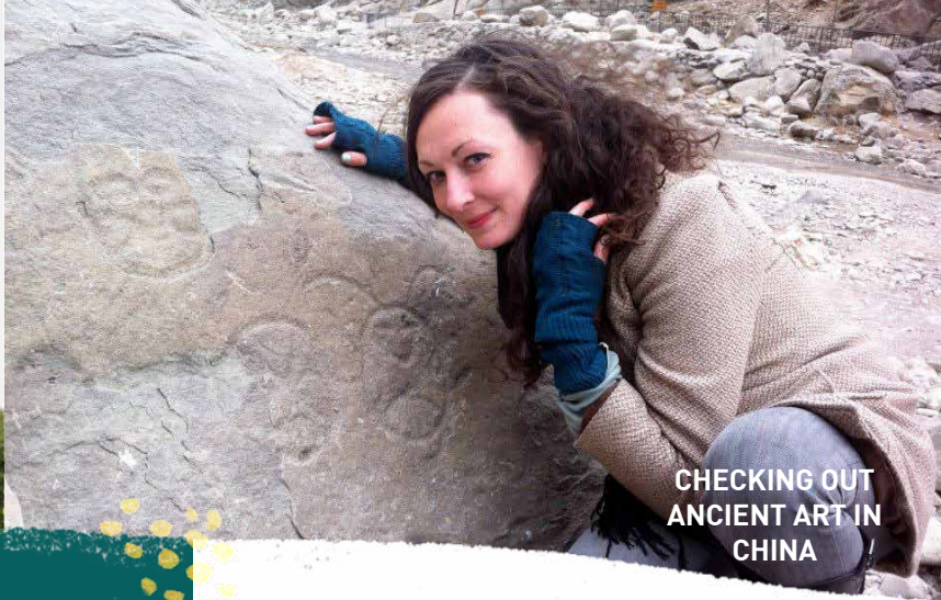
CHECKING OUT ANCIENT ART IN CHINA