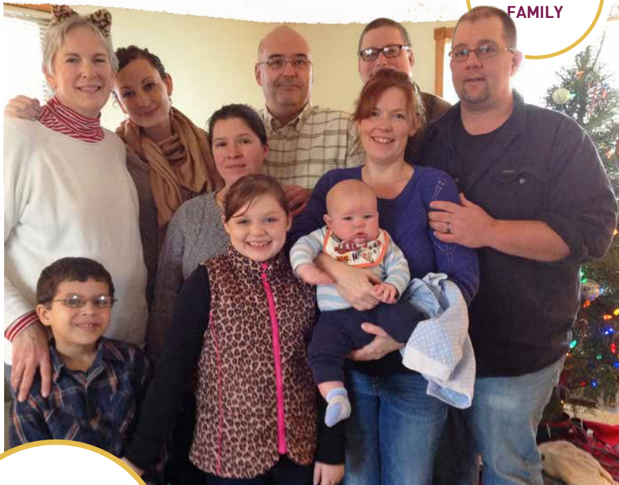
CHRISTMAS WITH MY FAMILY

I am super close with my two sisters, two nephews, and one niece. One of my sisters loves Disney, so we often take family trips there with the kids. It's a blast going on the rides together, sampling foods, and just spending the day together. Our family also likes to visit DC. We try to go about once a year, to soak in all the history and culture the capital has to offer.