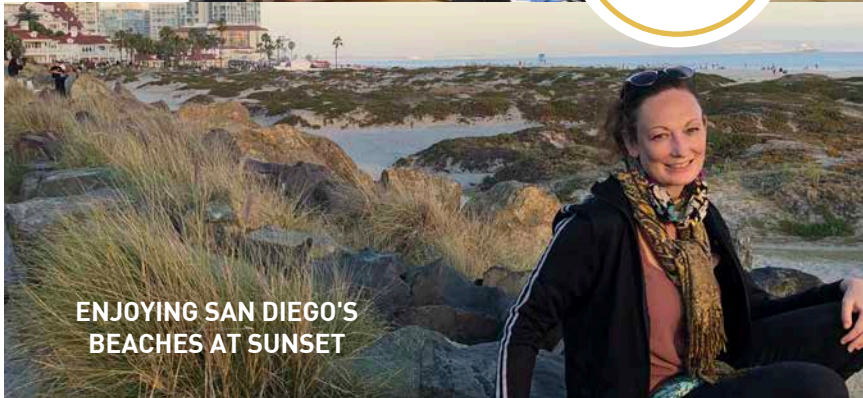
ENJOYING SAN DIEGO'S BEACHES AT SUNSET