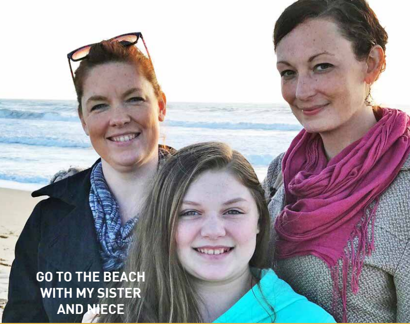
GO TO THE BEACH WITH MY SISTER AND NIECE