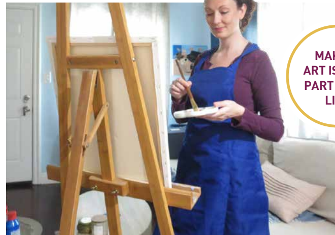
MAKING ART IS A BIG PART OF MY LIFE