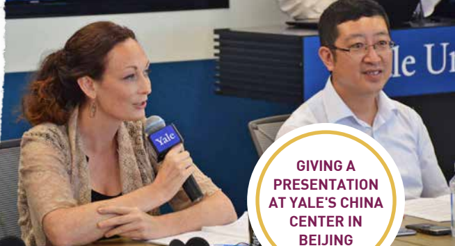
GIVING A PRESENTATION AT YALE'S CHINA CENTER IN BEIJING