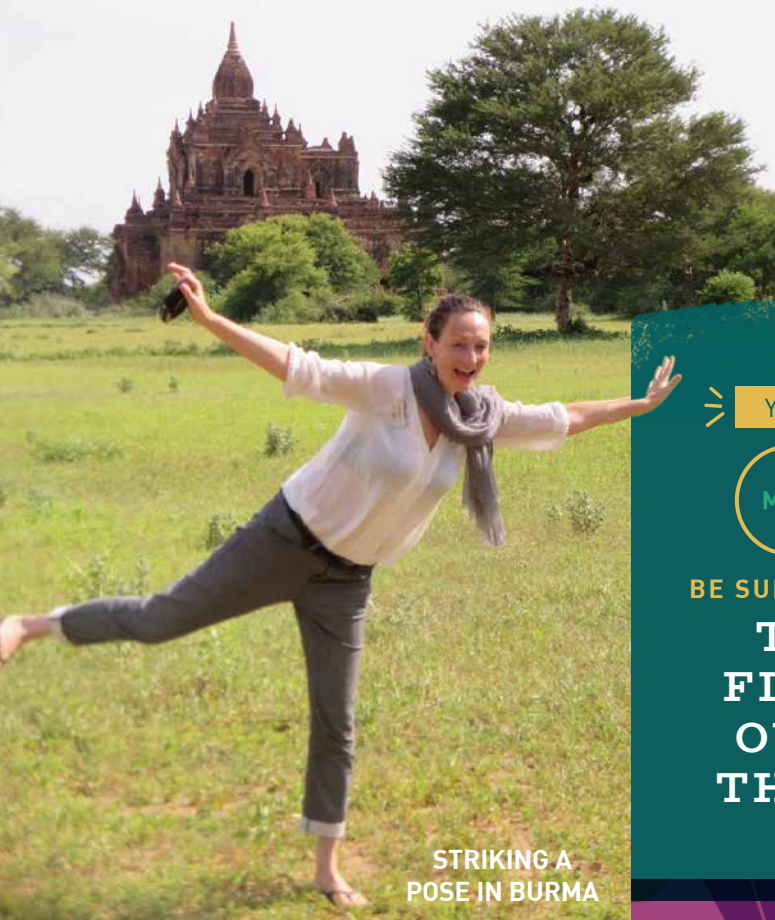
STRIKING A POSE IN BURMA