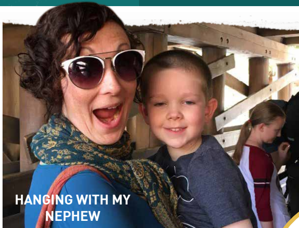
HANGING WITH MY NEPHEW