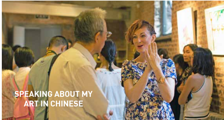
SPEAKING ABOUT MY ART IN CHINESE