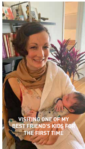
VISITING ONE OF MY BEST FRIEND'S KIDS FOR THE FIRST TIME