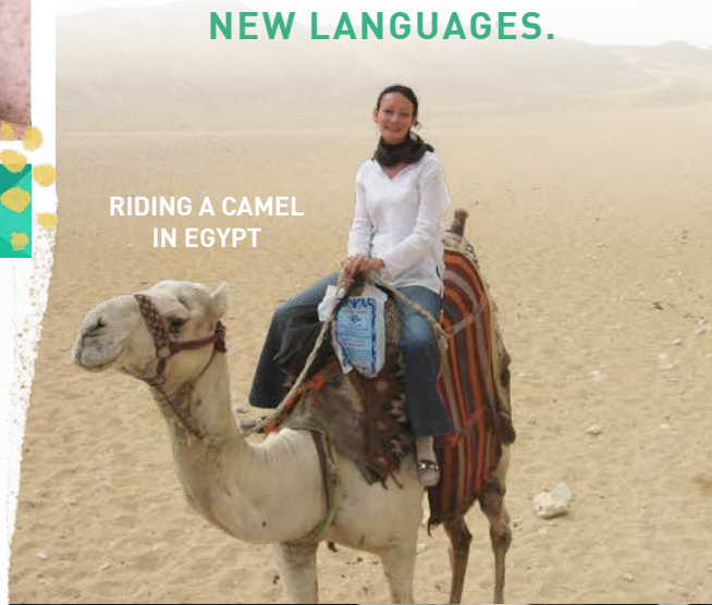
RIDING A CAMEL IN EGYPT

I AM Passionate ABOUT MAKING ART, GET EXCITED ABOUT COOKING, ENJOY NATURE, VOLUNTEER MY TIME, AND LIKE LEARNING NEW LANGUAGES.