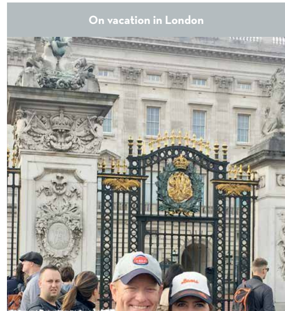
On vacation in London