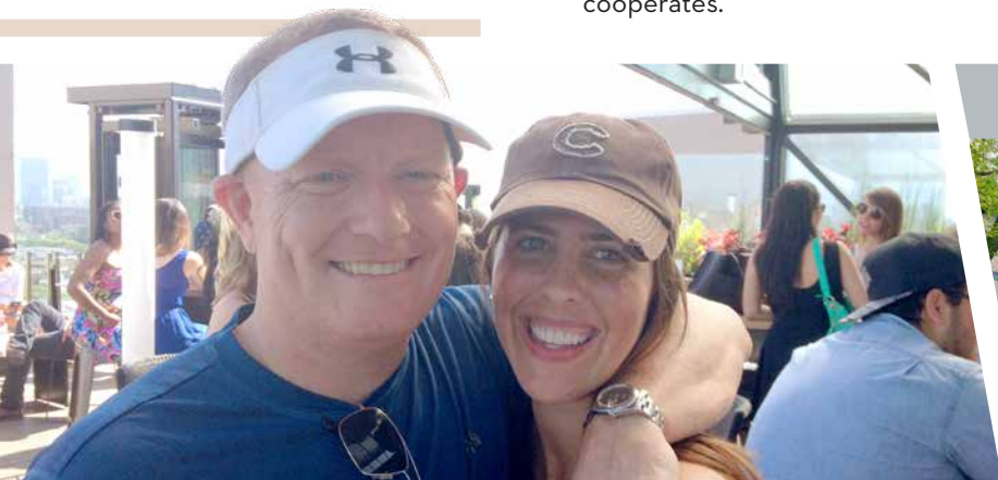
Nothing better than hanging out with friends on a Chicago rooftop!