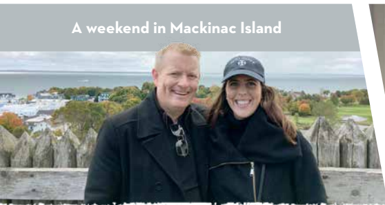
A weekend in Mackinac Island