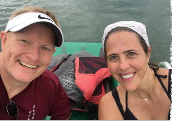
A beautiful day out on the water