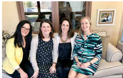
Celebrating with my close friends