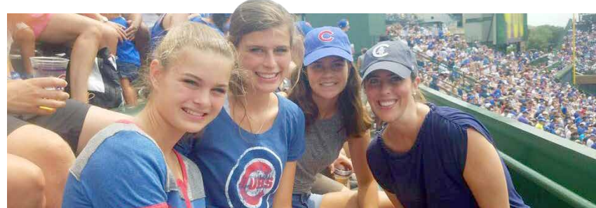
At a Cubs game with our nieces