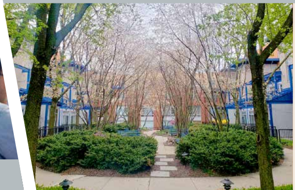
The courtyard in our gated community