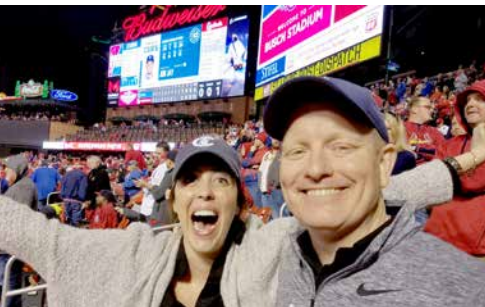
Cheering on the Cubs!