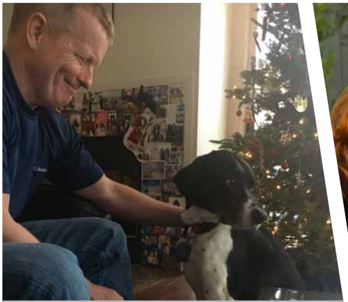
A man's best friend!