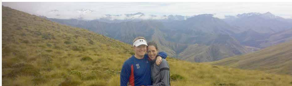
Hiking on our honeymoon - it was intense but we made it!

We send you all our heartfelt best wishes in your journey.