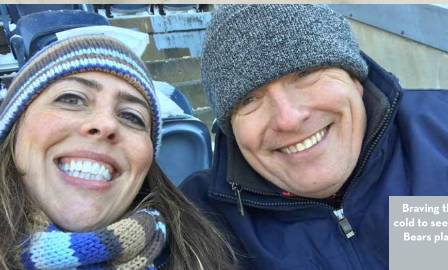
Braving the cold to see the Bears play!